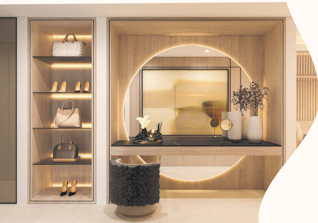
Warm & modern Texture & simplicity