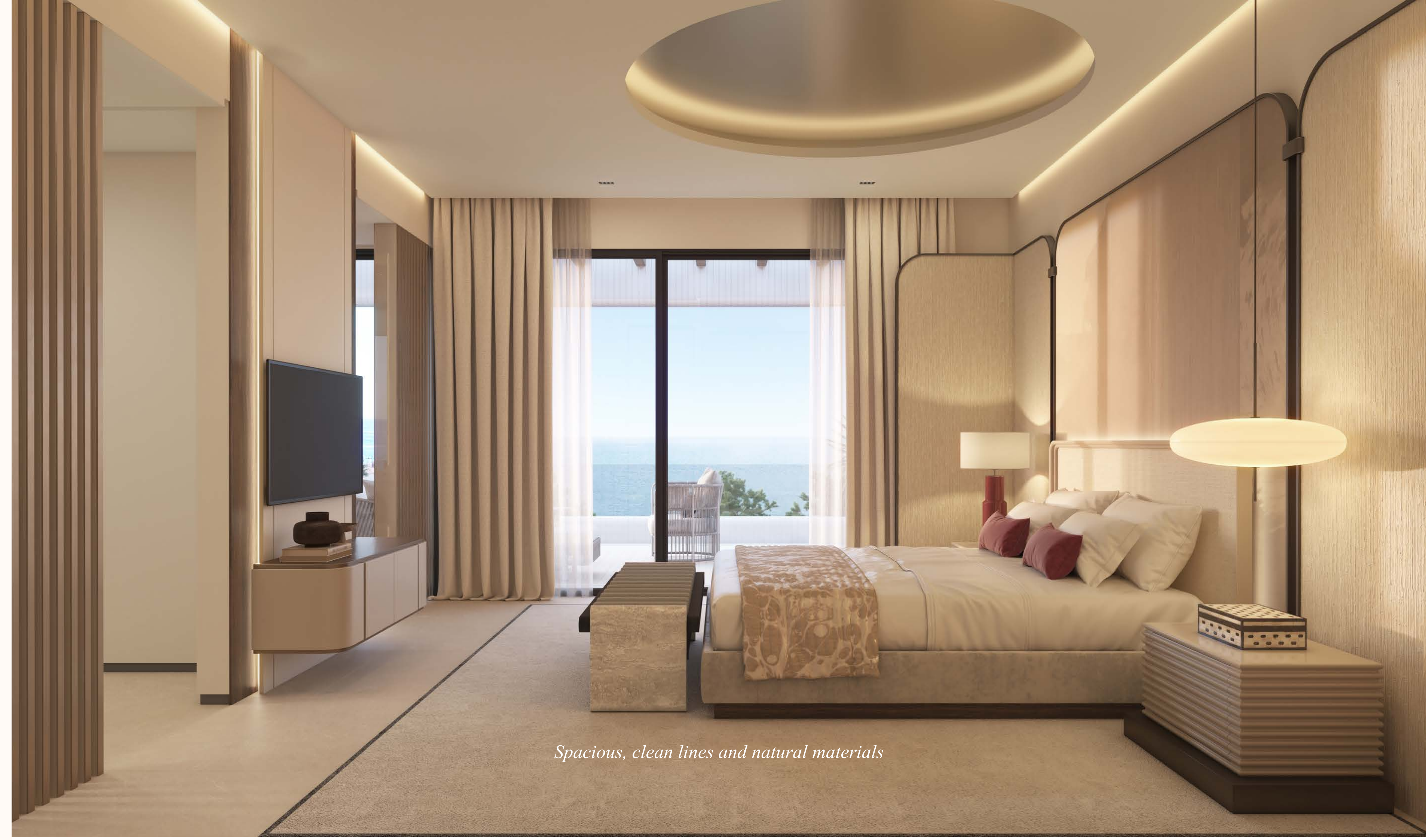
Spacious, clean lines and natural materials