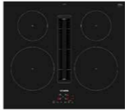
iQ300 Induction hob with integrated ventilation system 80 cm