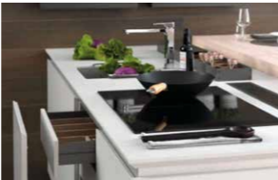
Etimoe Ice – Gris Hook Mate (Porcelanosa) Kitchen design