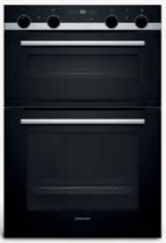
iQ500 Built-in double Stainless-steel oven